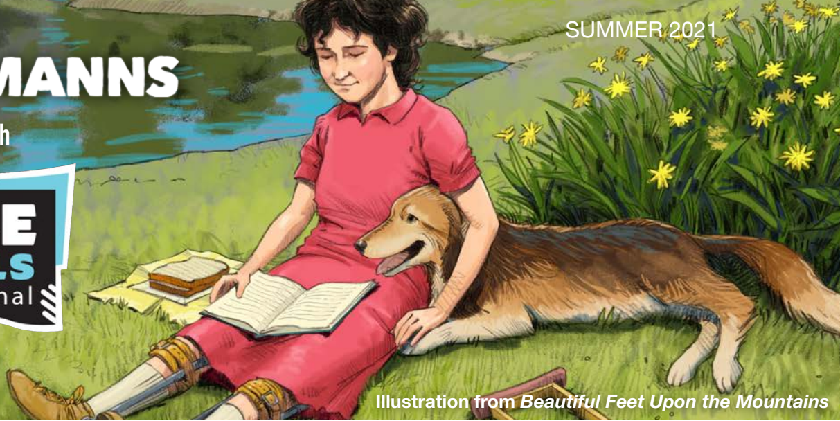
Illustration from Beautiful Feet Upon the Mountains