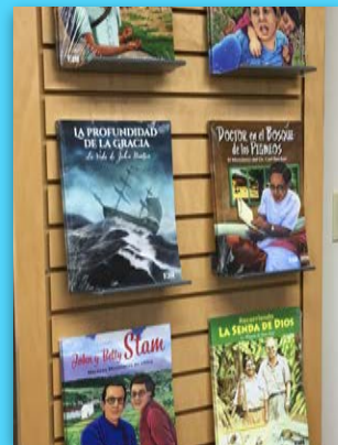
BVI Spanish materials printed by EBI