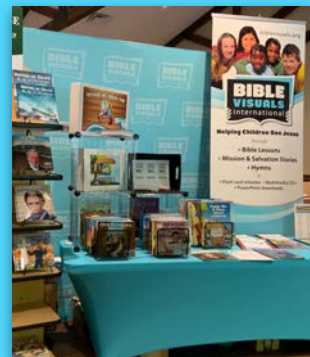
Representing BVI at a homeschool conference