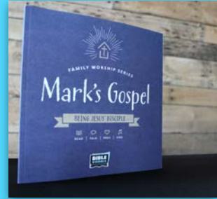
Our new Family Worship Series book —READ, TALK, PRAY, SING

Just like I'm doing right now, there is the ever constant need to share about BVI with ministry partners including our donors. Right now we are getting ready to host our first ministry banquet since things were shutdown because of Covid. These events have historically been a boost to us financially, but they have also helped forge relationships with new partnering churches and individuals. Our hope is to record this event so even if you can't join us, we'll plan to share it with you in the future.