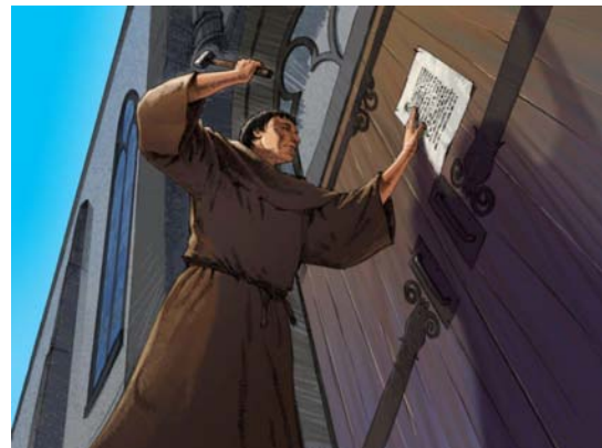
The Refuge, now in German! Seems appropriate.