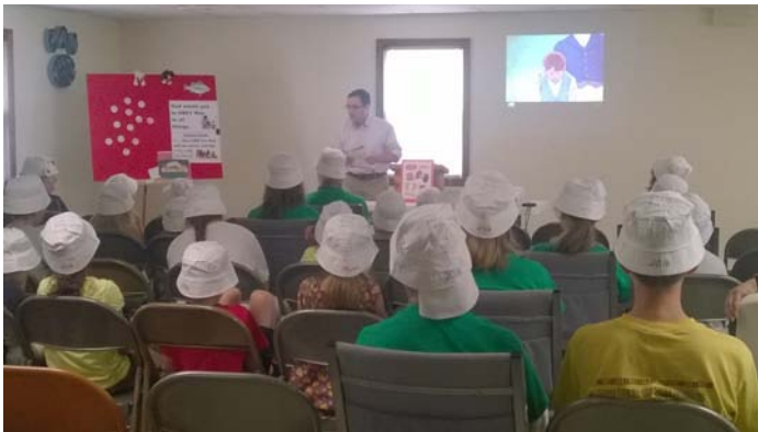
Sharing the story of God's amazing grace!

The children collected an offering to go towards our newest production project on Founding Father, Roger Sherman, called When I am Weak . Altogether they brought in nearly $500 to go towards this project.