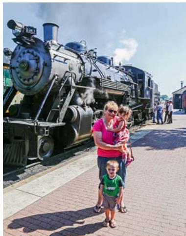
Jesse & Ginger stayed with friends while we were at camp.