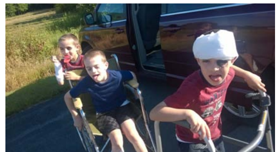
Fake-an-injury day at camp