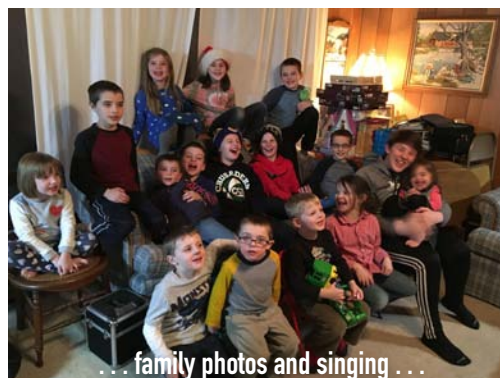
. . . family photos and singing . . .