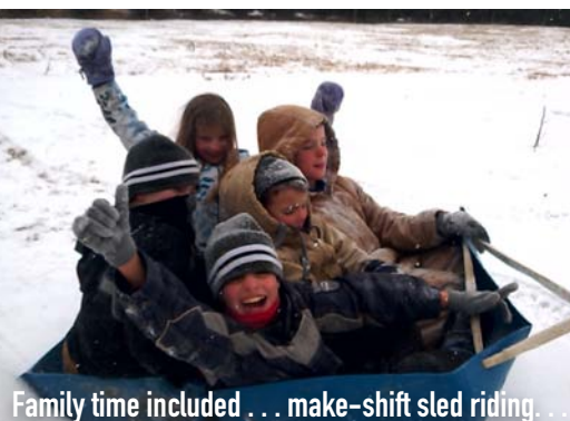
Family time included . . . make-shift sled riding . . .