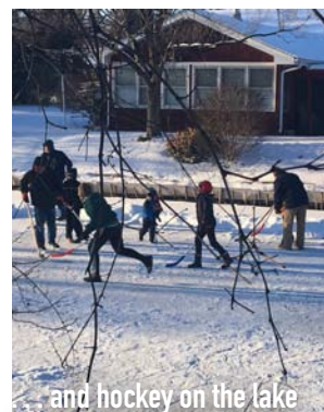
. . . and hockey on the lake