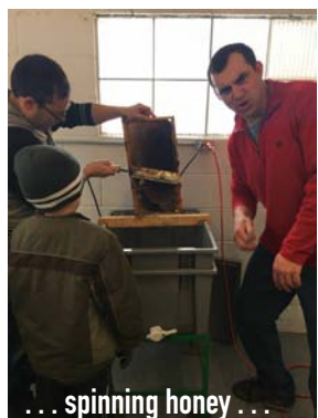
. . . spinning honey . . .