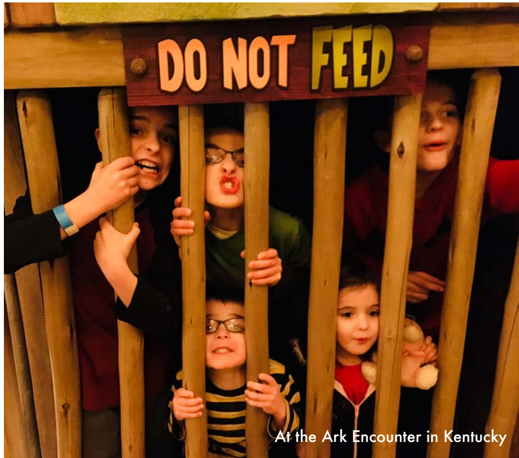
At the Ark Encounter in Kentucky

Serving with Bible Visuals International