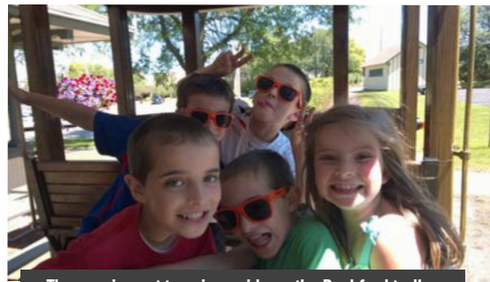
The cousins got to enjoy a ride on the Rockford trolley