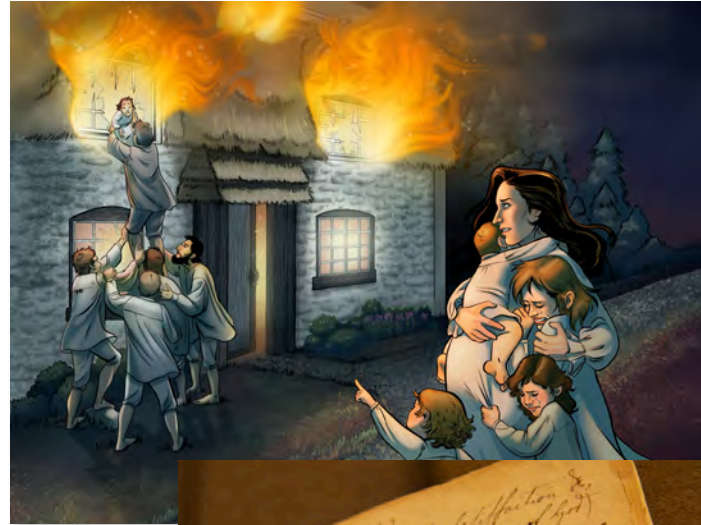
(top) Illustration of John Wesley's rescue from Filling a Little Space .