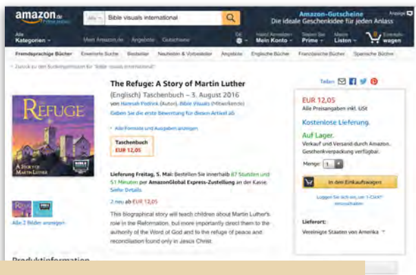
amazon.de (Germany) listing of The Refuge

Let me share with you a platform we've been exploring recently. Createspace is a company owned by Amazon that allows people to self-publish their materials. We've set up some of