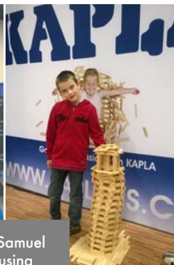
The Kapla booth hangout