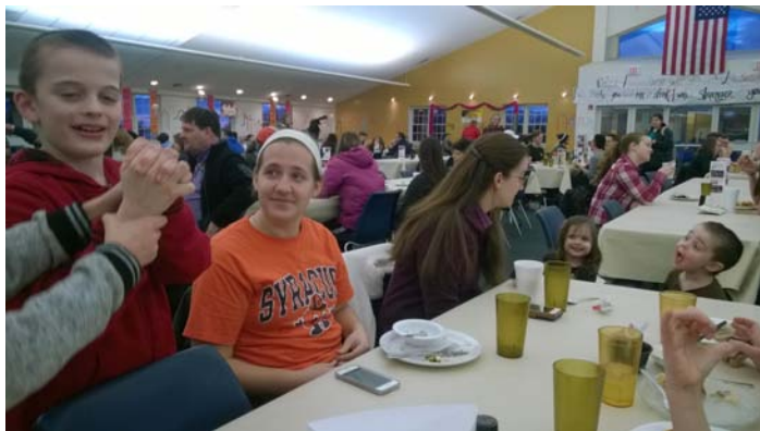
Having fun with LBC students

In February I represented Bible Visuals at the missions conference down the road at Lancaster Bible College. While I had some good conversations with students at our display, I had more interaction in the evenings when our family came on campus for supper. Nothing seems to open conversations than having a group of energetic kids with you! I was also able to speak in a few science classes and share in particular how technology has affected our ministry in three areas—product creation, distribution and presentation.