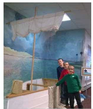
"Fishing for men" conference at Westminster

In March we took part in another local missions conference. This time it was at Westminster Presbyterian Church (PCA) which is also down the road from the office. Folks from this church have