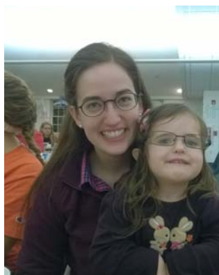
Ginger's studios look